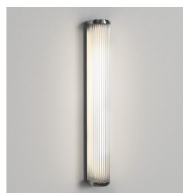
CODE: 1380084 FINISH: POLISHED CHROME

To maintain this product to its best condition, please view our care and cleaning guide on the support section of the astro website.