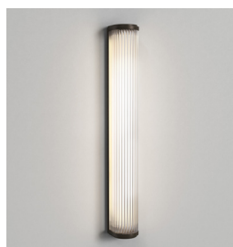
CODE: 1380082 FINISH: BRONZE