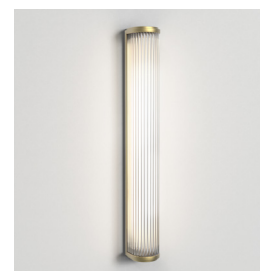
CODE: 1380083 FINISH: MATT GOLD